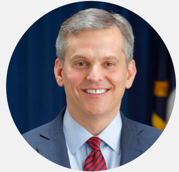
Josh Stein State of NC Attorney General